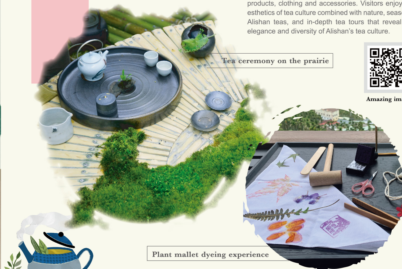
Tea ceremony on the prairie

Flowers · Prairie · Tea Ceremony · Tea Art Season ▶ March