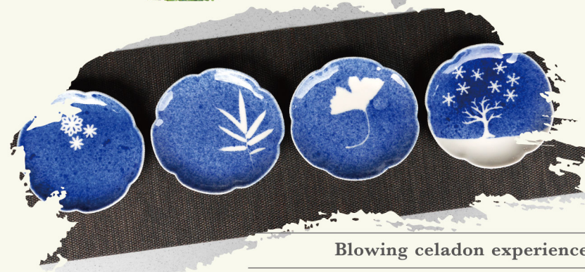
Blowing celadon experience

In the winter, there are gorgeous views of mountains draped in low-lying clouds and mist, which appear to be straight out of a landscape painting. In such beautiful settings, winter takes on a new and refined meaning. Traditional residences in Alishan preserve both history and elegance. In winter, in front of an old residence, enjoy the nostalgia and the warmth of tea, as you admire every detail of the scenery. Taste the teas of Alishan, which possess the spirit of the mountains and the essence of nature. Partake in a dialogue between tea and culture, view the green hues of mountain forests, and immerse yourself in the tranquility of a mountain town.