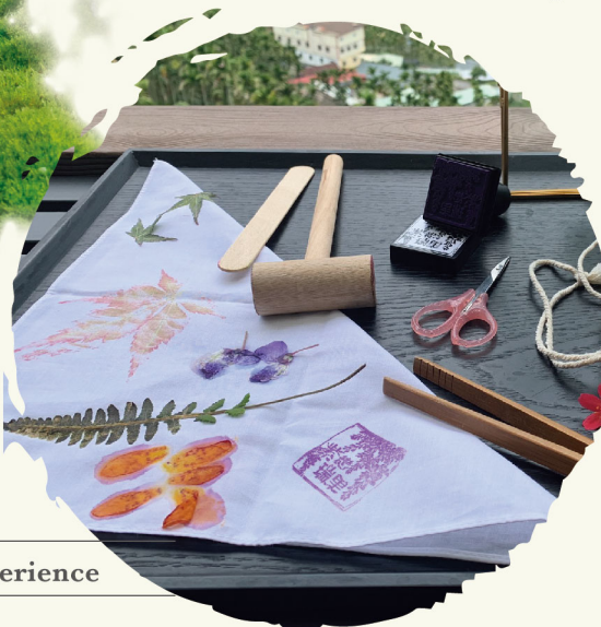
Plant mallet dyeing experience

The Spring Tea Party is when the exposition-style Alishan Four Seasons Tea Tour exhibition takes place. Creative tea culture, local ecology, and cultivated plants are highlighted, in addition to seasonal flowers and decorated tea ceremony spaces to showcase the tea growing areas of Greater Alishan on the Niupuzi Love Prairie.