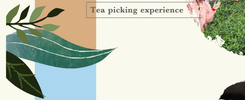
Tea picking experience

River · Bamboo Forest · Waterfall · Tea Plantation Season ▶ September