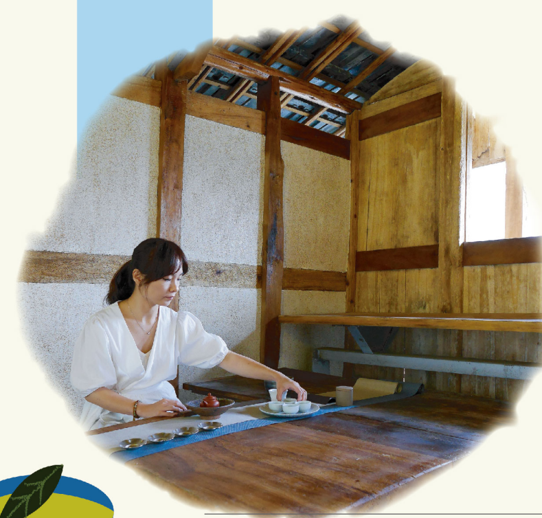
Tea ceremony in an old residence

Old Residence · Old Street · Sea of Clouds · Glass Light Season ▶ December