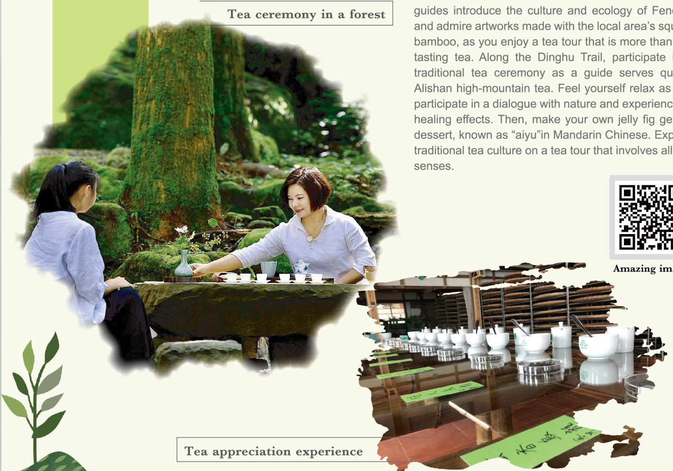
Tea ceremony in a forest

Forest Railway · Forest · Old Trail · Ecology Season ▶ July