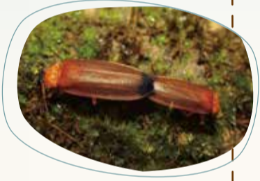
Luciola anceyi 大端黒螢

春夏に見られるのは、黒翅螢 (Luciolacerata E. Olivier)・大端黒螢 (Luciolaanceyi)・端黒螢 (Luciolagorhami)・椋徳氏脈翅螢 (Curtosauteri Olivier)・黄緑螢 (Luciolaficta)。黒翅螢は胸部が橙色で、黒的の羽鞘が特徴。大端黒螢は前胸の背板と前羽が橙色だが、羽の端は黒色で、端黒螢と形態が相似するが、発光器の前の節が黒色かどうかで区分する。椋徳氏脈翅螢は前胸の背板が黄褐色で、背板の中央に明らかな黒色の斑紋があり、羽の側縁に皺状の脈が出ている。黄緑螢は中央の羽鞘の繋ぎ目に明らかな黄色の細かい紋があるのが特徴。