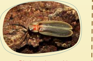
Diaphanes lampyroides 鋸角雪螢

山窗螢は体型が大きく、とても明るい光を発する。前胸の背板の前縁に二つの窓のような透明部分があることから「窗螢=マドホタル」と呼ばれる。鋸角雪螢の外型は雪螢と相似するが、鋸刃状の触角と羽鞘基部の黒斑で区分できる。神木螢は前縁に2枚の弧型をなす透明斑があり、触覚が糸状をなし、身体が全体に前が小さく後が大きい。橙螢はその名の通り身体が全体に橙色。雙色垂鬚螢は触角が櫛の歯状に細かく分かれ長い。