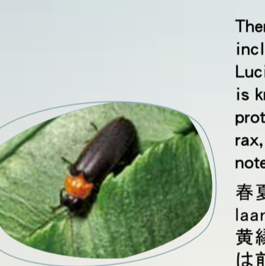
Luciola cerata olivier 黒翅螢

Fireflies in spring and summer (from March to June) 3-6月春夏の蛍