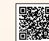
Alishan Forest Railway 阿里山森林鐵路時刻表