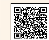
Taiwan Tourist Shuttle Bus Website