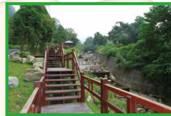
Guanghua Yima Creek Trail 光華駅馬 步道