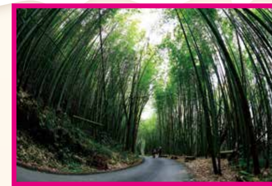
Green Tunnel 緑のトンネル