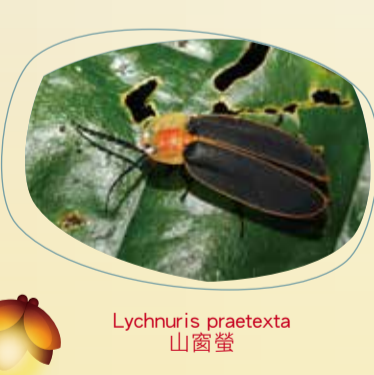
Lychnuris praetexta 山窗螢

Fireflies in autumn and winter (from October to March) 10月 翌年3月秋冬の蛍