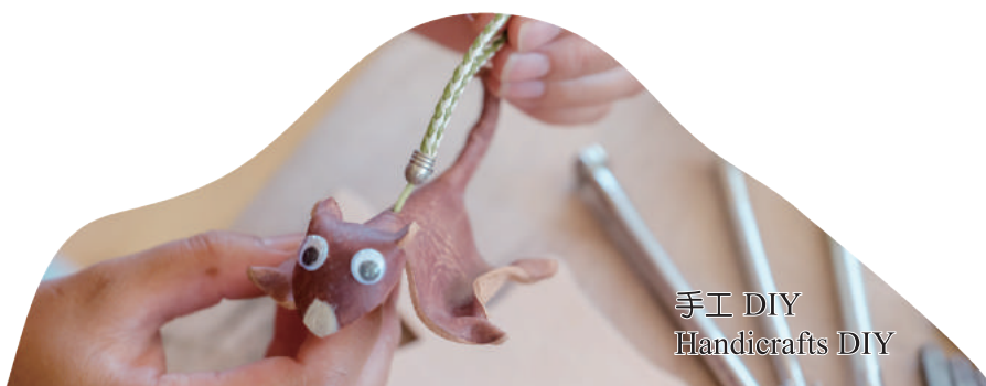
手工DIY Handicrafts DIY

In Niahosa, there is an area of 30 hectares devoted to the production of tea seeds. Every 10 hectares only produces 1000 catties of tea seed oil. This is one of the high economic value crops in this community. The production line (including planting, harvesting, processing packaging and marketing) is managed by a local team. This oil is considered very healthy and called "the olive oil of the East".