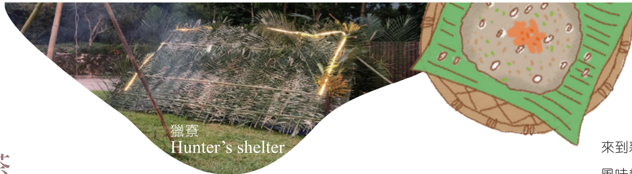
獵寮 Hunter's shelter